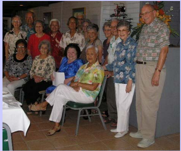
Class of 1945 celebrates 65th reunion in June, 2010